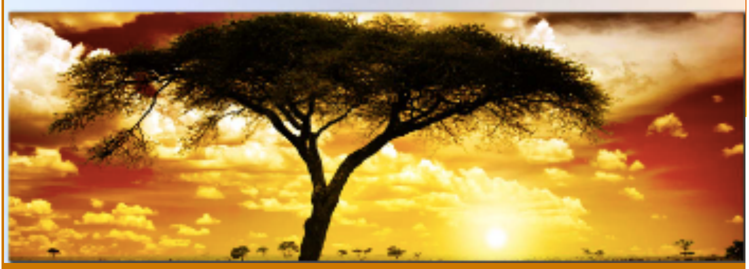
Land of Mystery and Marvels Another beautiful sunrise to enjoy with your breakfast!

There are only 328 days before we leave!!! Are you ready? :>)